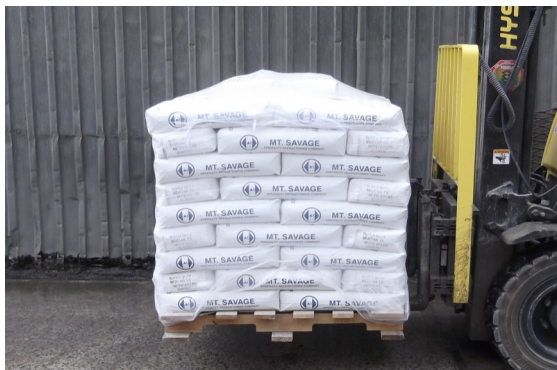
Q-TEK™ SUPER is now available in 50 lb. bags

Q-TEK™ Super is available in 50, 60, 70, 85, and 95% alumina contents. Aluminum resistant additives can be added to all versions. Shelf life is at least six months, and may be longer if properly stored. Being available in 50 lb. bags, it can make an excellent shop repair mix, available for small to major repairs.