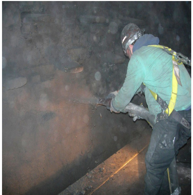
Cement free shotcrete being installed onto a blast furnace stack.

Based on this new technology, MSSR has introduced new SAVAGE X™ shotcrete and gunning mixes. The aggregate systems that are used mirror low cement offerings, ranging from fireclay to high purity alumina, zirconia containing for the cement industry, silicon carbide, and fused silica.