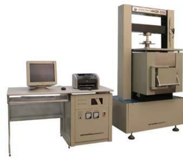
Typical Hot Modulus of Rupture Testing Apparatus

A typical data sheet will have MOR numbers for specialty products after drying, after some reheats, and sometimes at given temperatures. MOR after 1500°F is common for refractory castables and gunning mixes, because this is hot enough for them to completely dehydrate the cement but cool enough to not form glassy phases that would increase the strength after heating. This temperature was chosen as giving a minimum strength in conventional, high cement castables; and in these products, was always less than dried strength. With the advent of low cement, ultra-low cement, and no cement castables, however, this strength was often higher at this temperature than dried because of other bonds that were forming.